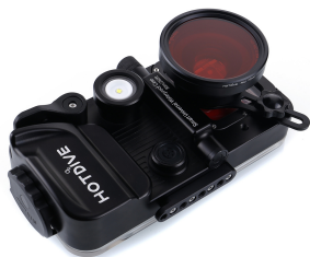
H2 / H2 pro with wide-angle lens and red filter