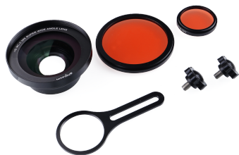
Wide-angle lens and red filter