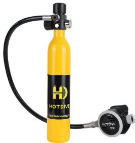
Mini T10 Orange Bottle