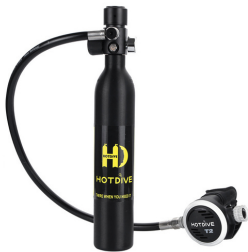
Mini T10 Black Bottle