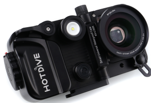
H2 / H2 pro with wide-angle lens