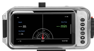
H2 Pro with depth sensor