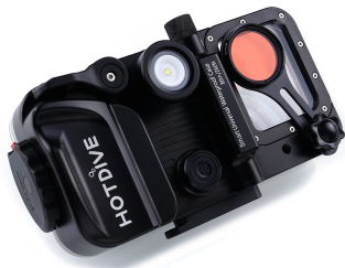
H2 / H2 pro with red filter