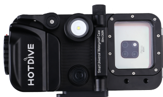
Hotdive Phone Housing