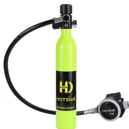
Mini T10 Green Bottle