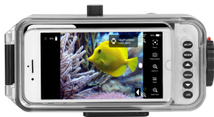
H2 w/o depth sensor